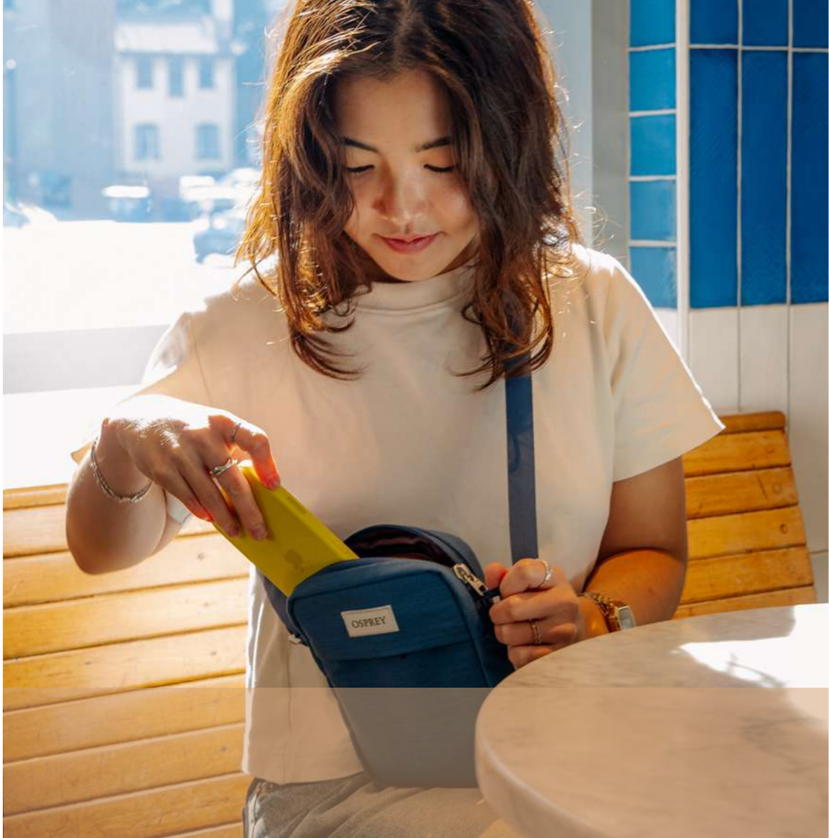
All products styles and colours subject to availability.

Our curated collection of premium merchandise is crafted with durability, design and purpose in mind. We believe that great products should do more than just look good. They should be made to last, with quality materials and timeless design that stand up to everyday use and reflect true value over time. Our product selection is built for longevity – the kind of merchandise people reach for often and use again and again.